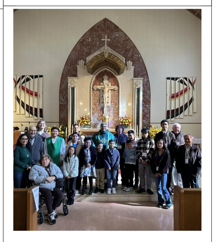
Faith Formation gathering at 10:30 am Mass, last Sunday.