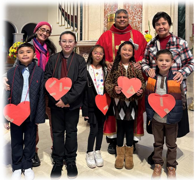
First Reconciliation at St. Elizabeth Church February 3, 2024

In the spirit of penance, the faithful should not lightly excuse themselves from this obligation.