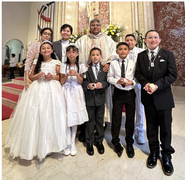
Congratulations to the Faith Formation students who received their First Holy Communion on Sunday, May 5 th .

* 1.5% Circle donors have an asterisk next to their name. ($500.00 and more) Amount Assessed: $32,089.00 ~ Amount collected to date: $41,690.00