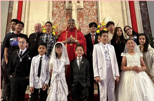
Concluding Mass of Faith Formation May 19, 2024