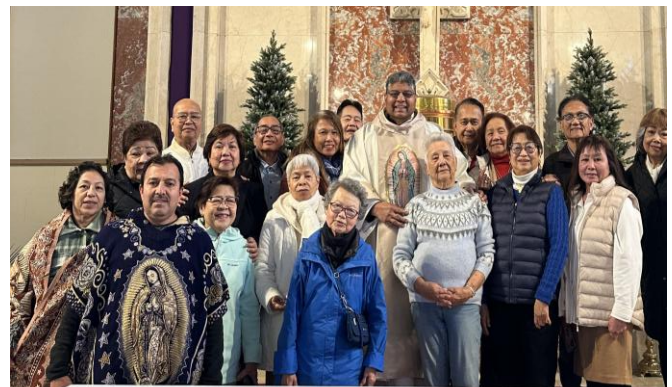
Feast of Our Lady of Guadalupe, Thursday, December 12 th

Not all dates are available for Mass Intentions, so we ask that you be prepared with alternate dates and times. If your requested date is not available an alternate date will be chosen for you.