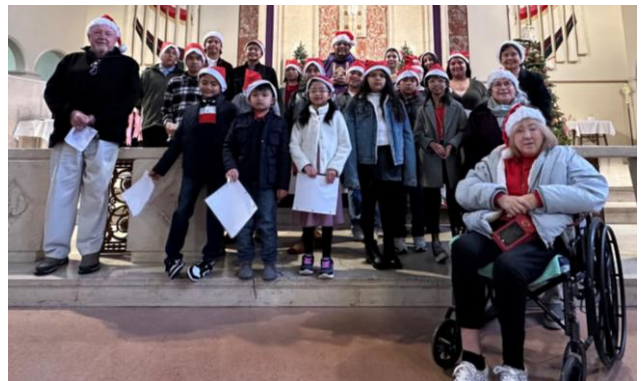
Faith Formation Christmas Mass Sunday, December 15 th .

Not all dates are available for Mass Intentions, so we ask that you be prepared with alternate dates and times. If your requested date is not available an alternate date will be chosen for you.