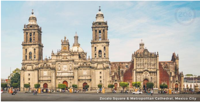
Zocalo Square & Metropolitan Cathedral, Mexico City