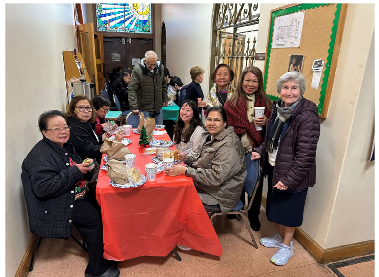
Simbang Gabi 2025