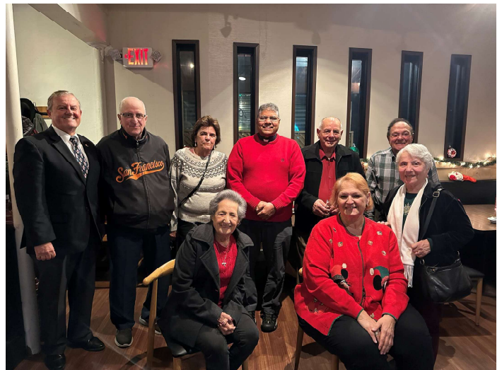
Christmas Dinner with Maltese Society

If you are interested in donating flowers for the high altar in celebration of a special occasion, birthday, anniversary and more, please see the sign-up sheet in the front of the Church. Please see a sacristan before or after mass for more information.