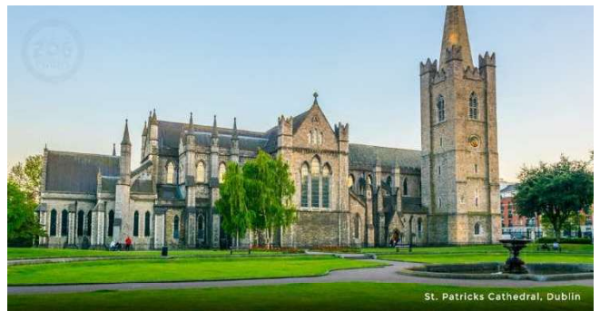
Northern Ireland Pilgrimage 2026

If you are interested in donating flowers for the high altar in celebration of a special occasion, birthday, anniversary and more, please see the sign-up sheet in the front of church. Please see a sacristan before or after mass for more information.