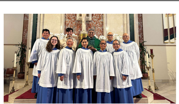
St. Elizabeth's Choirs